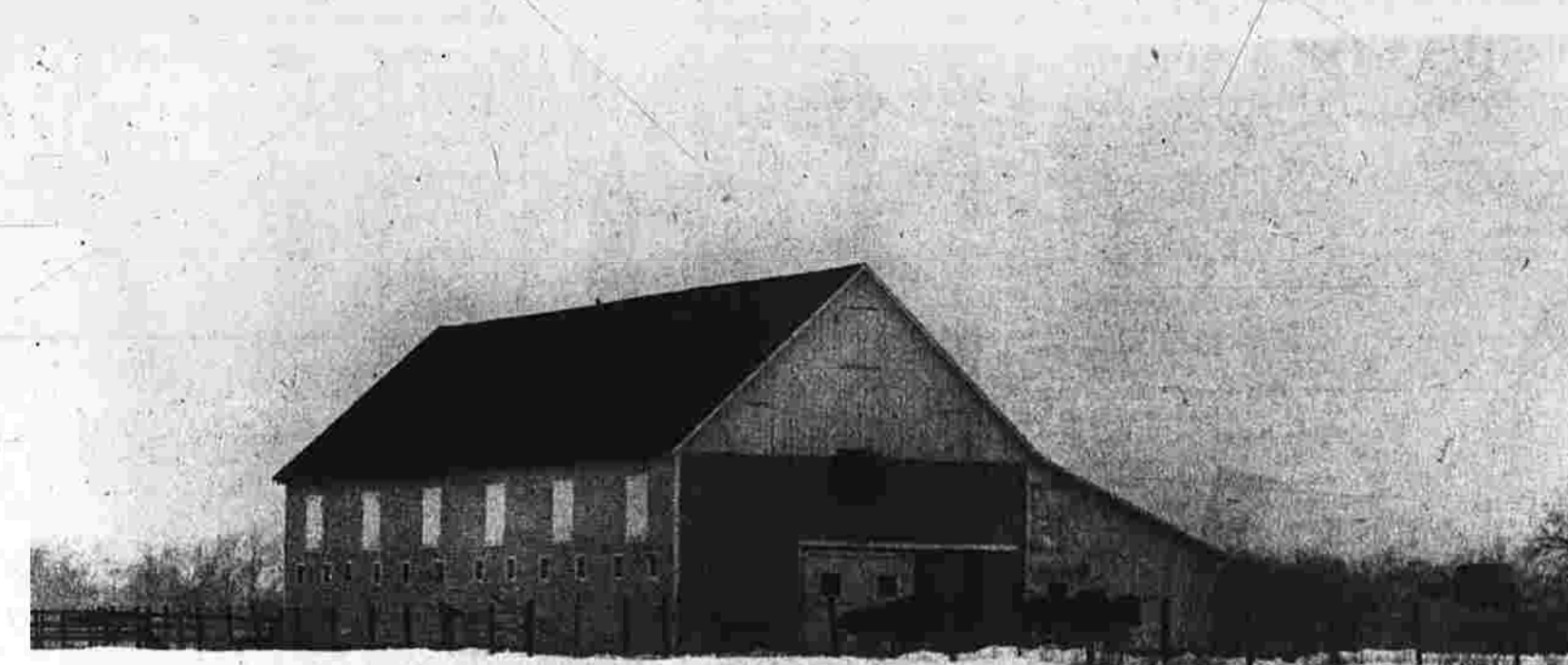
FARM SCENE, GLASTONBURY

Precisely because we have no other choice, we must understand that rationality can mislead, that elegant logic can be fragile that brilliance of mind is no real substitute for wisdom of experience. If we can learn that much from what we have gone through, then the torments of the '60s will not have been entirely in vain. — WALL STREET JOURNAL